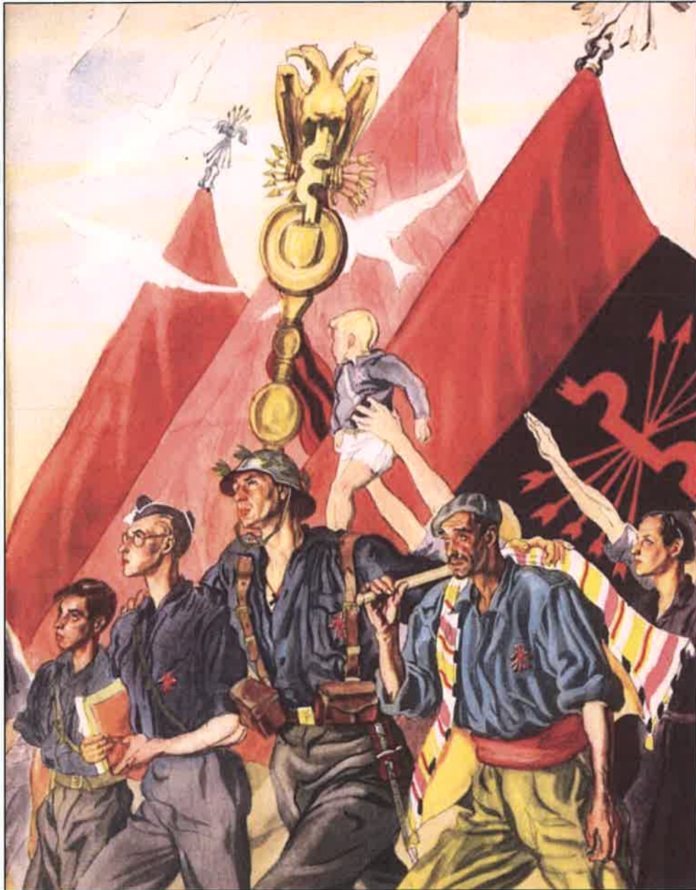
Nationalist poster from the Spanish Civil War, about 1936

About the Poster Spanish men, women, and children march forward in unity under the banner of the fascist-inspired Spanish Falange party, as white doves of peace fly overhead. The Falangists were one component of the right-wing National Bloc that formed in Spain to oppose the leftist Popular Front. The right-wing Nationalists looked to the army and General Francisco Franco to bring order to Spain, a country that had suffered from years of political chaos and uncertainty. The Nationalists also hoped to unite all right-wing interests to save Spain from the dangers of socialism and communism.