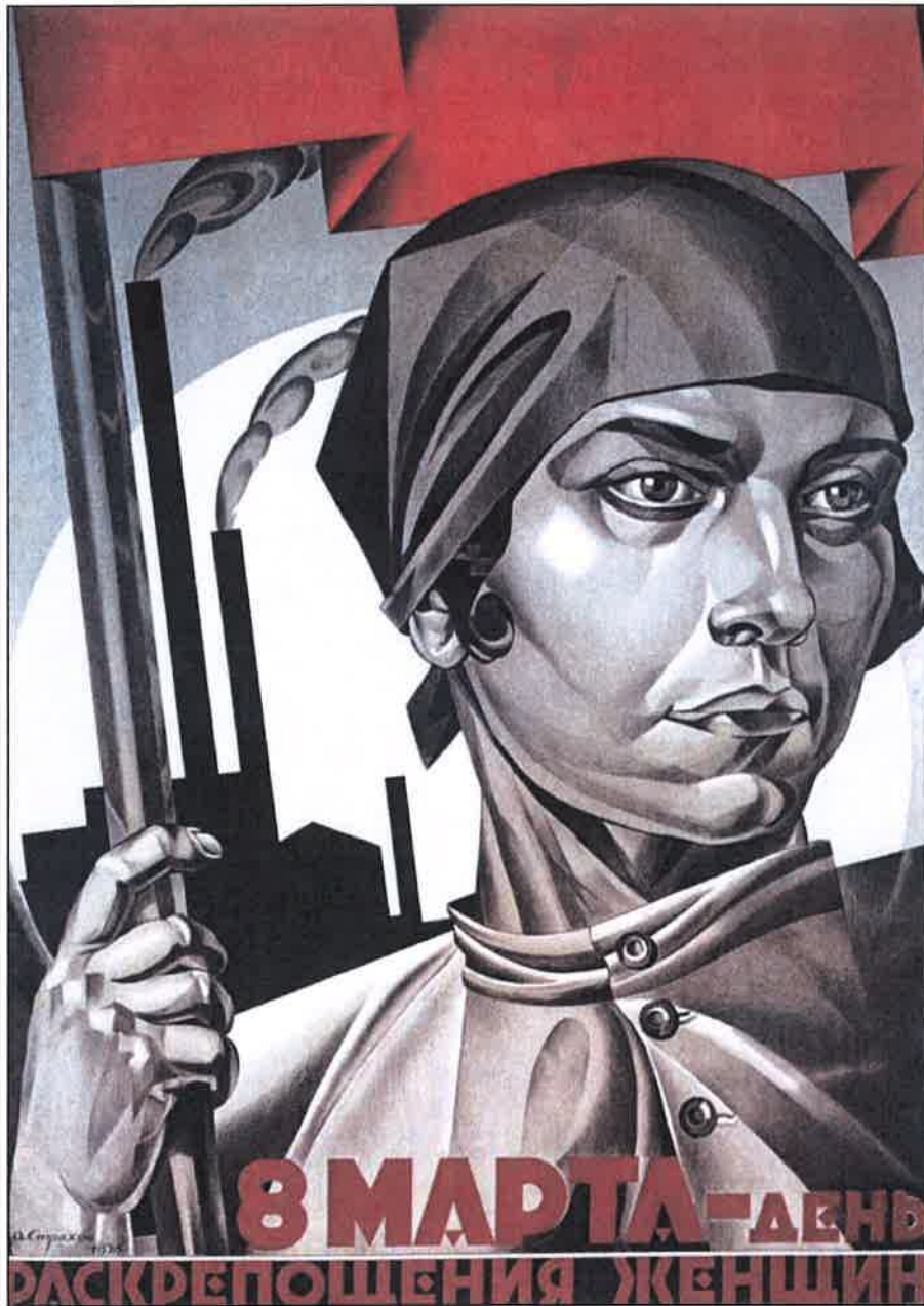
Soviet poster celebrating women's emancipation, 1920

About the Poster A Soviet woman proudly holds the red banner of socialism. She is dressed as a factory worker and stands in front of a factory, a place where she likely would not have worked in pre-revolutionary times. The Soviets held that the socialist revolution had “emancipated” women from their inferior status under capitalism. The 1936 Soviet Constitution declared women's rights to vote, to work, to attain an education, and to be given equal legal status with men.