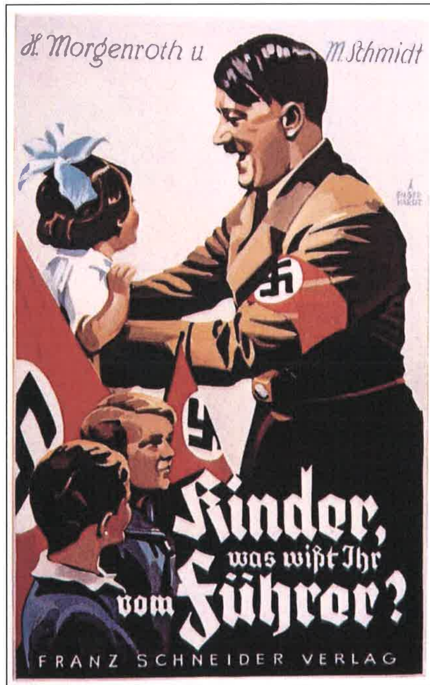
"Children, what do you know about our leader?" Nazi poster from 1934

About the Poster The slogan reads, "Children, what do you know about our leader?" Hitler (the Fuhrer , which means "leader") is shown caringly lifting a young girl. He is surrounded by Nazi flags and young supporters, probably members of the Hitler Youth. Hitler inspired mass personal loyalty throughout Germany. Many families hung portraits of him in their homes.