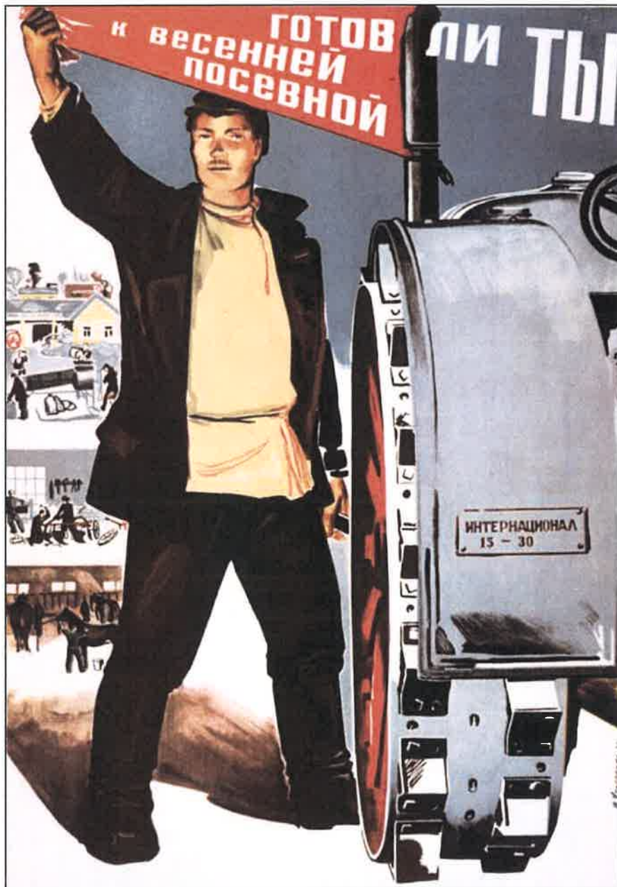
"Are you ready for the spring sowing?" Soviet Poster from 1932

About the Poster A Soviet farmer is shown with a new tractor, the latest in farming technology, below the slogan, "Are you ready for the spring sowing?" This poster was created during Stalin's First Five-Year Plan, which focused on the collectivization of agriculture through the creation of large state-owned farms. Another goal of the Five-Year Plan was the introduction of modern, efficient farming machinery. Scenes of life on a collective farm are shown behind the farmer.